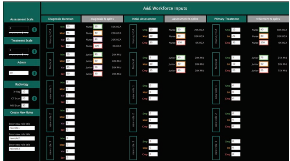
Fig 3. Workforce staffing model demonstrating how analysis of which staff groups undertake which types of clinical activity can be used to support the addition of advanced clinical practitioners in a new emergency centre. This dashboard is currently being worked into an updated version of the Workforce Repository and Planning Tool.

recommendations, it informed wider thinking regarding system transformation. For example, the first case study highlighted how outlying non-surgical patients, theatre flow and A&E admissions need to be considered when redesigning the surgical workforce. This prompted further use of WRaPT in A&E and acute medicine to support the redesign of clinical pathways, thereby helping the trust with performance targets in areas with chronic workforce shortages.